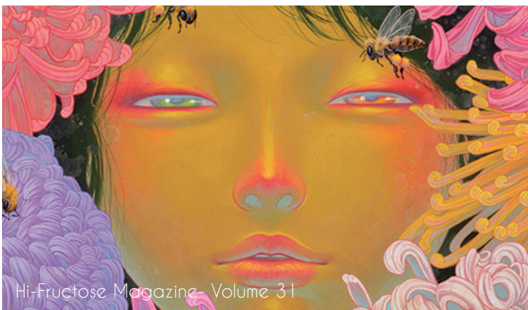
Hi-Fructose Magazine - Volume 31